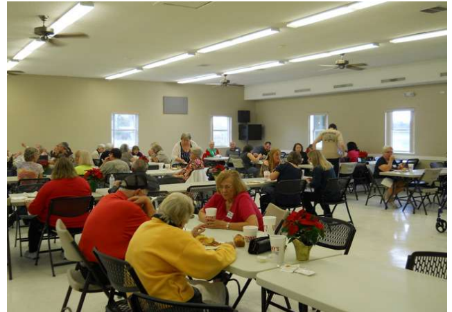
Members enjoying a great meal