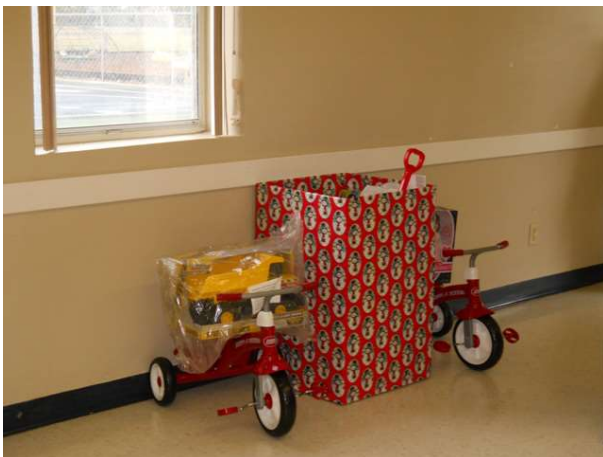
Toys collected for Fire Dept.

This annual event was free to all of our home owners in Tracy's Point Community Club, where membership has its privileges. Be sure to attend our January 15th dinner meeting where we all are bringing a dish to share, while enjoying the New Year's ideas for events and community involvement.